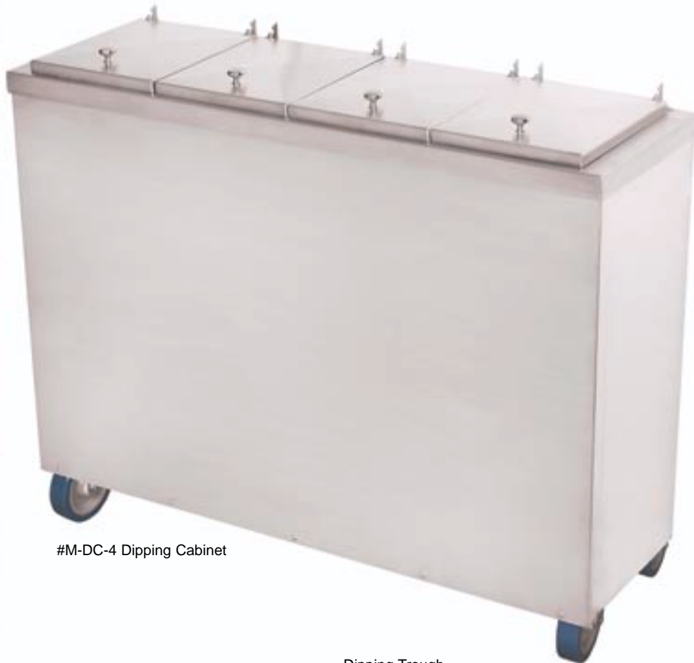
#M-DC-4 Dipping Cabinet